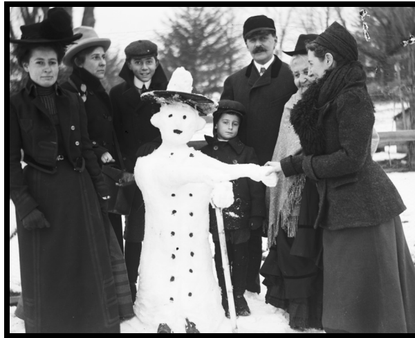
Winter Scenes from Bohemiana, Home of the Taylor Family