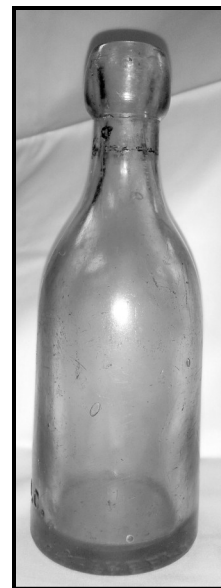
This plain, unassuming bottle provides an important link to Freeport's past.